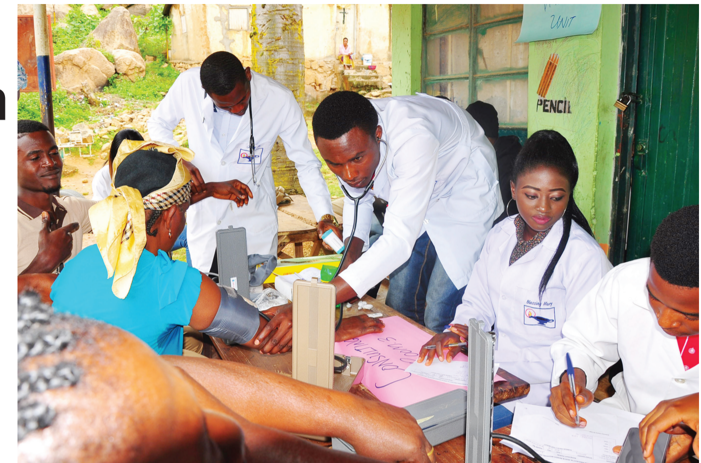
The Block Malaria Project Medical youth team providing free medical services to a low resource community in Jos, Plateau State Nigeria

Objective 1: At continental and regional levels, and through the engagement of young Africans in the diaspora, youth in existing structures are mobilized to form an 'ALMA youth army' to contribute to ending malaria and expanding universal