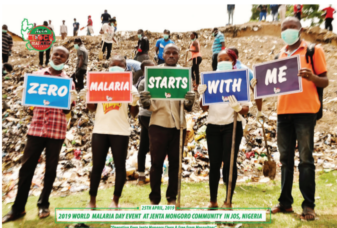
World Malaria Day Event at Jenta Mongoro Community in Jos, Nigeria.

Young people across Africa are motivated to take action, and understand malaria's impact on their lives and future. A new campaign – Zero Malaria: 'Draw the Line Against Malaria' – is inspiring African youth to drive unstoppable action in the countries hardest hit until they reach zero malaria. The youth-focused, Africa-first global campaign invites the next generation to join the 'Zero Malaria Starts with Me' movement. It is for these reasons that ALMA has developed the ALMA Youth Strategy.