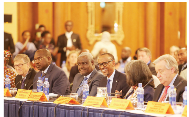
Africa Leadership Meeting: Investing in Health