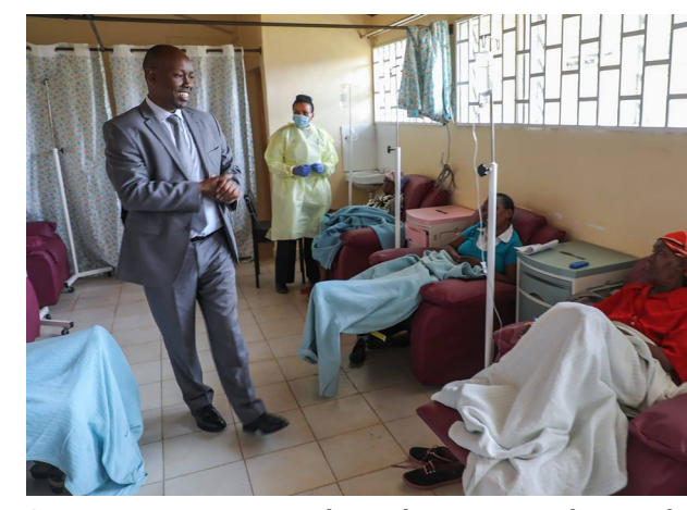
Governor Lee Kinyanjui tours the oncology centre at Nakuru Level Five hospital.