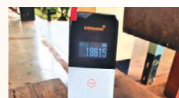
Initial indoor condition