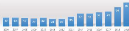
GROWTH TREND OF JAPANESE COMPANIES IN KENYA

JETRO Nairobi office: Email: ken@jetro.go.jp Tel: +254 11 101 2300/+254 743 300 460. Address: Riverside Drive, 2nd Floor, 9 Riverside.