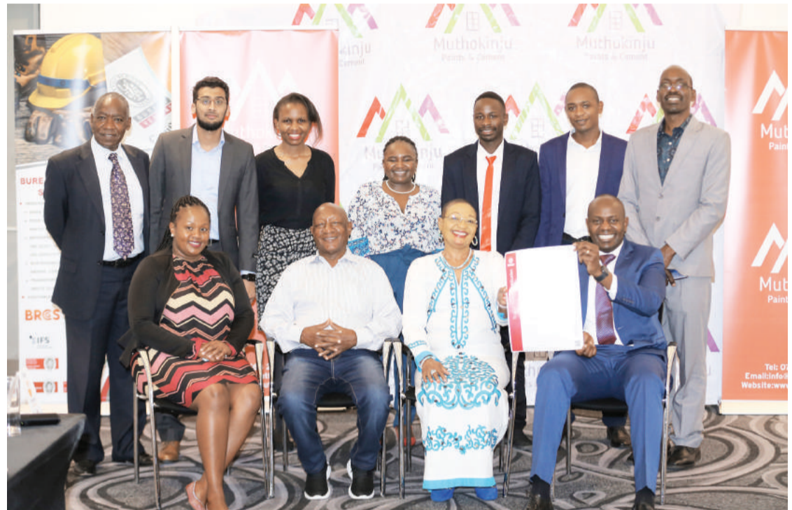
The founders and the management team.